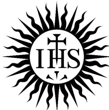
Solar emblems of the ancient pagan Babylonian sun god Shamash (left, Source: Louvre stele) and the Catholic Jesuit Order (right).